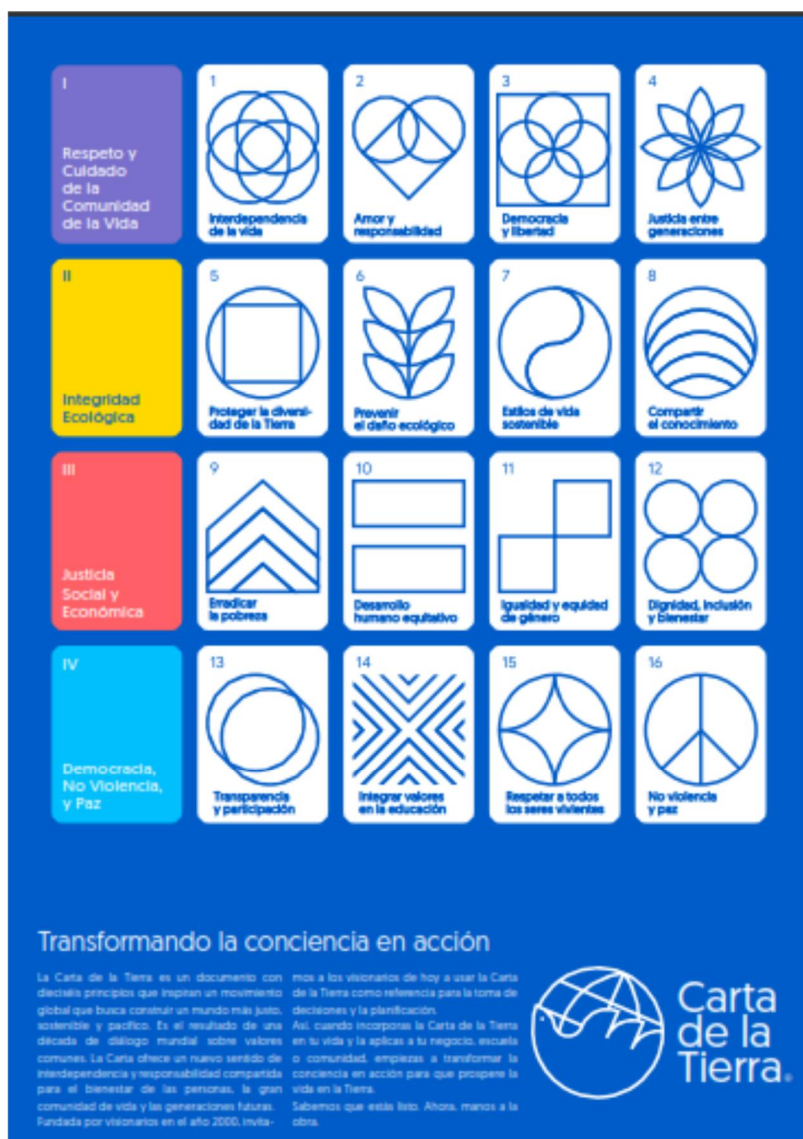
Figure 5. Poster of the Earth Charter. The sixteen actions that the letter proclaims are graphically summarized. UNESCO and the IUCN (World Conservation Union). www.earthcharter.org . www.cartadelatierra.org

However, we are also afraid that unfortunately, in a few weeks, when the fear of the coronavirus stops us from “clenching our throats” and the desire to continually talk about the pandemic and the lies and truths of this reality is extinguished, everything will return to silence. We are afraid that everything will return to the sad reality of selfishness, to which we cling upon also hope that soon enough, the clouds will open on the horizon, and those who keep the illusion and the desire to fight for a better world will be illuminated by the Earth’s Charter. Remembering the words of Miguel de Cervantes (free translation): “ Know that all these storms