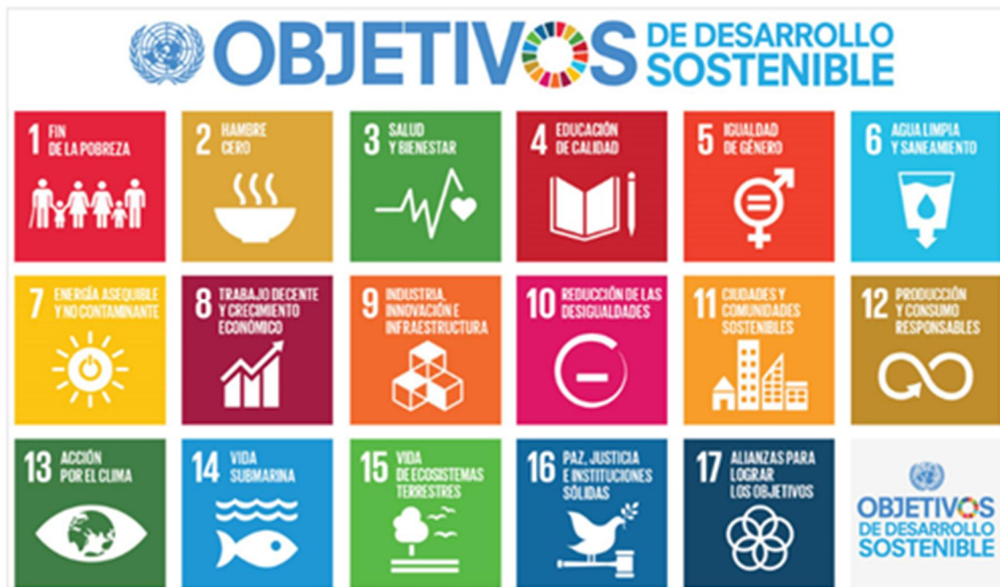
Figure 4. Sustainable development goals. WHO, 2016. (25)