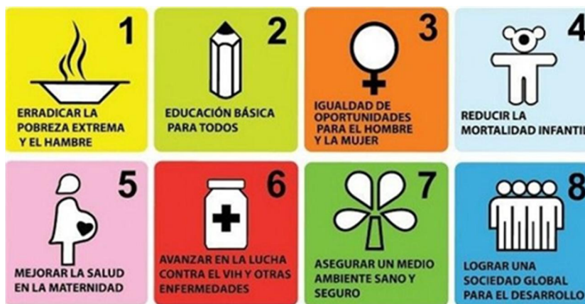
Figure 3. Millennium Goals, WHO, 2000. (24)

Echarter also includes a message and a poster that brings together its most important values of solidarity, respect and good work, that are in tune with the goals of the 2000 millennium and the goals of a caring world 2015 (Figures 3-5), which invites us to nurture from “otherness”. There is no doubt that this letter to Earth that requests our help to make the world more sustainable, promotes the fight against climate change and the challenges of anthropocene, (23) which as we have seen are directly related to new pandemics, such as SARS-CoV-2/COVID-19.